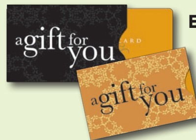
E Tyvek Card Glove 3.5" x 2.25" Available in: Black or Mustard Sold in 100's