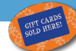
M Floor Decal (Oval) 16.25" x 24.5"