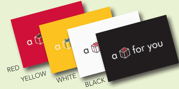
A Generic Card Carrier 4.75" x 6.5", with a 1.5" pocket to hold your gift card. Sold in 100's