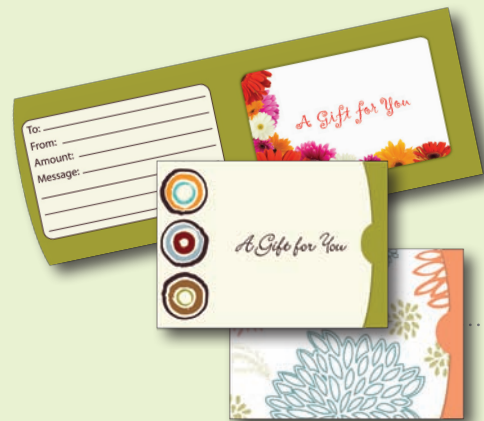
D Side-Fold with Die Cut Carriers Cards may be attached using the provided die cuts. Available in: Flowers or Circles Sold in 100's