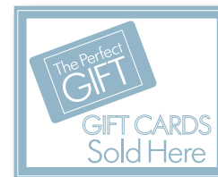
L White Static Cling with metallic blue print Clear Static Cling Sign with white and blue print. 6" x 4.75"