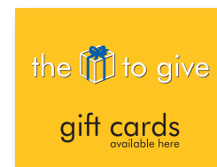
J Yellow Static Cling 6" x 4.5"