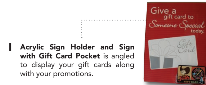
I Acrylic Sign Holder and Sign with Gift Card Pocket is angled to display your gift cards along with your promotions.