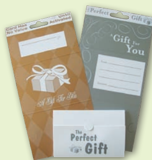
C Hanging Carrier Top is perforated for clean tear off after purchase and folds up into a card carrier for gift giving as shown. Cards may be attached using the provided die cuts. Available in: Gold, White or Silver Sold in 100's