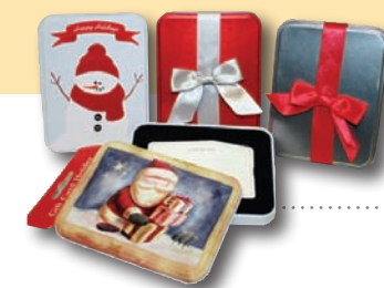
Q Holiday Gift Card Tins Each case contains 24 units (6 of each design) and comes with 2 clip strips. Sold by Case

To place an order for any of the items shown in this catalog, please contact Card Marketing Services, a division of National Business Products. 800.757.1492 • www.cardmarketingservices.com