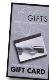
N Check Presenter Insert A personal reminder to your customers that gift cards are available. 4.25" x 7.25"