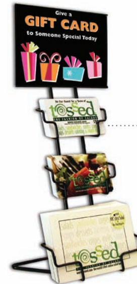
G Display Stand 02 Advertise your cards in this sleek metal rack.