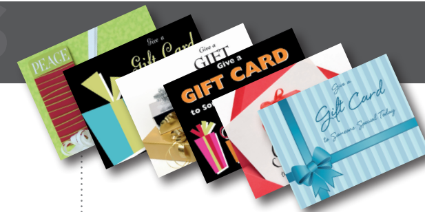
H Sign Variety Pack (6 total) Easily change the signs to reflect upcoming holidays or as reminders of special occasions. Use with Display Stand 02—item G.