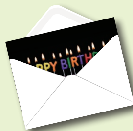
B The Standard White Envelope is a great way to seal the deal. 3.5" x 5" Sold in 100's