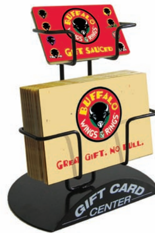
F Display Stand 01 This black metal stand is perfect for the hostess stand or at the checkout.